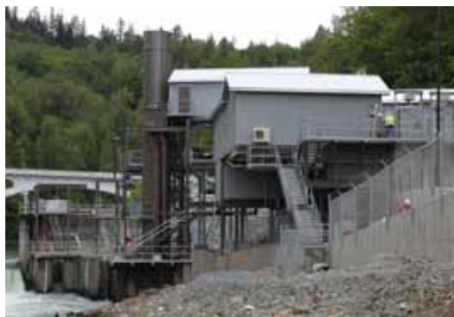
PSE’s new Baker River fish trap-and-haul facility

Salmon in northwest Washington’s Skagit River basin are getting another big boost from PSE with this summer’s completion of a new trap-and-haul facility for moving adult salmon upstream around PSE’s two hydroelectric dams on the Baker River.