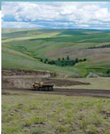
Grading roads for the project

PSE currently owns and operates the 87-turbine, 157-MW Hopkins Ridge Wind Facility near Dayton and the 149-turbine, 273-MW Wild Horse Wind and Solar Facility near Ellensburg. PSE is recognized by the American Wind Energy Association as the nation’s second-largest utility owner and operator of wind power.