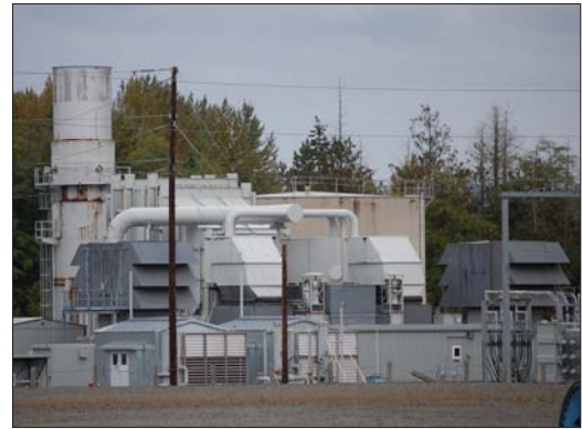
Fredonia Generating Station

PSE today owns eight natural gas-fired plants, all in Washington state. One of these is the Fredonia Generating Station in Skagit County.