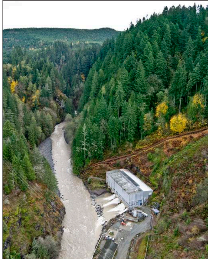
Electron powerhouse, along the Puyallup River in East Pierce County

The Electron Hydroelectric Project is located in the western foothills of Mount Rainier, about 42 miles southeast of Seattle along the Puyallup River, near Kapowsin, Pierce County.