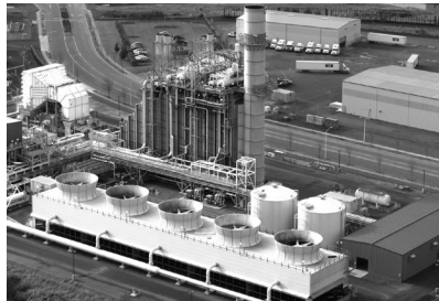
Mint Farm natural-gas fired power plant.

Please reference docket numbers UE-090704 (electric) and/or UG-090705 (natural gas). (See the other side for all the ways you can comment.)