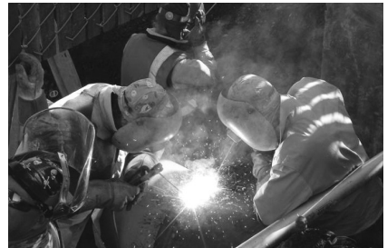
PSE installed or replaced 220 miles of natural gas pipelines in 2008.