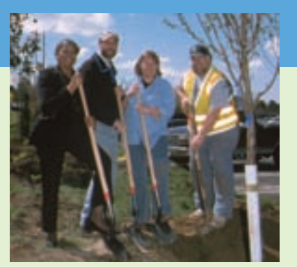
PSE employees help communities plant low-growing trees.

PSE has received the Tree Line USA award from the Arbor Day Foundation for nine years in a row in recognition of the utility's efforts to protect and enhance urban forests while ensuring reliable service.