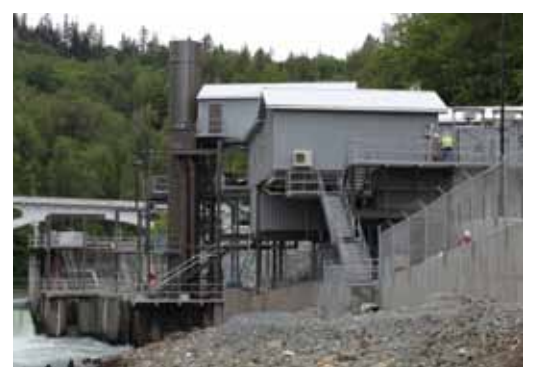
PSE's new Baker River fish trap-and-haul facility

State and federal fisheries agencies, which collaborated with PSE and local Indian tribes on the project, are hoping for a four- to five-fold increase in the Baker River's already rebounding runs of sockeye and coho salmon.