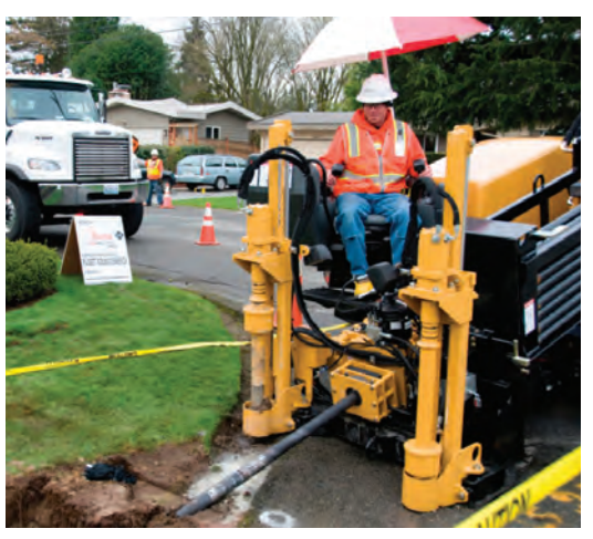
Natural gas main upgrade work in Bellevue

PSE's 24,000 miles of natural gas mains and service lines to residential, commercial and industrial customer meters consist of a mixture of steel and plastic pipe in various ages and conditions. Throughout the year, 150 natural gas technicians