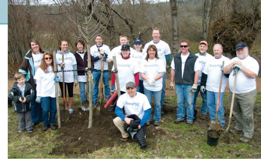
TeamPSE representatives and family members plant trees in Snoqualmie, a Tree City USA community.