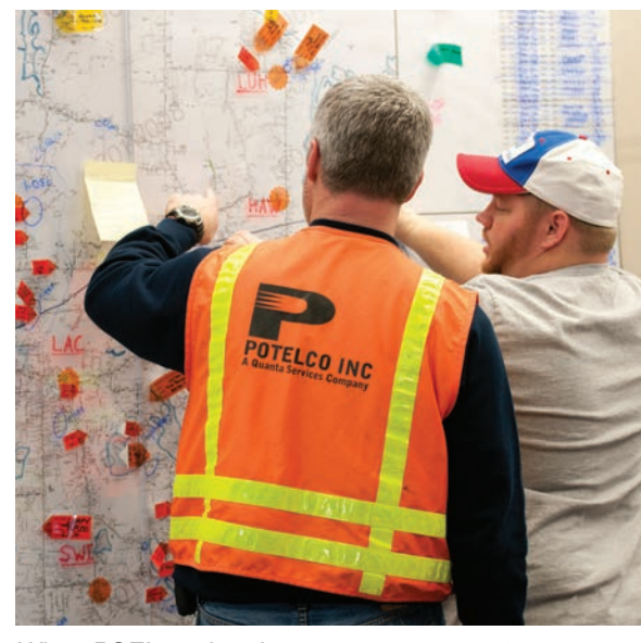
When PSE's updated outage management system comes online later this year, utility employees will use computers, not sticky notes, to track restoration efforts.

Moving away from decades-old systems, PSE has adopted a new outage management system (OMS) that will assist in crew management, improve powerrestoration efforts and provide customers with more accurate information on the status of outages.