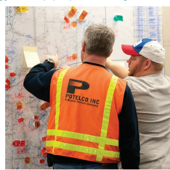
When PSE's updated outage management system comes online later this year, utility employees will use computers, not sticky notes, to track restoration efforts.

Moving away from decades-old systems, PSE has adopted a new outage management system (OMS) that will assist in crew management, improve power-restoration efforts and provide customers with more accurate information on the status of outages.