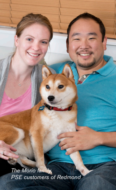
The Morio family PSE customers of Redmond