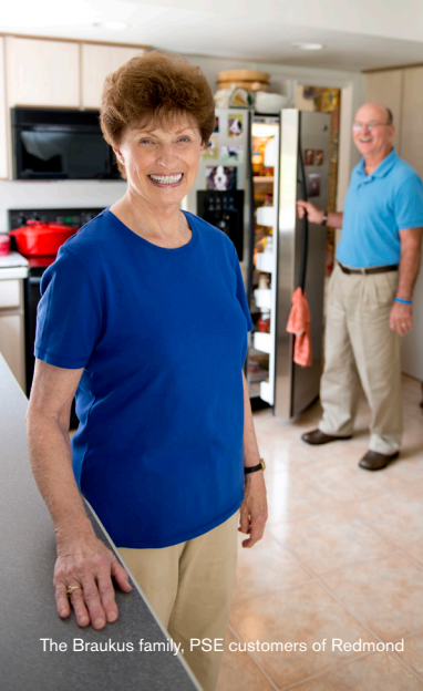
The Braukus family, PSE customers of Redmond