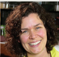
Bedford Family, Seattle: Fearing nothing - they bought a house from hoarders