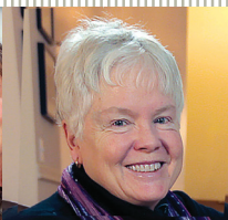
White Family, Redmond: Tapping the whole family's talent