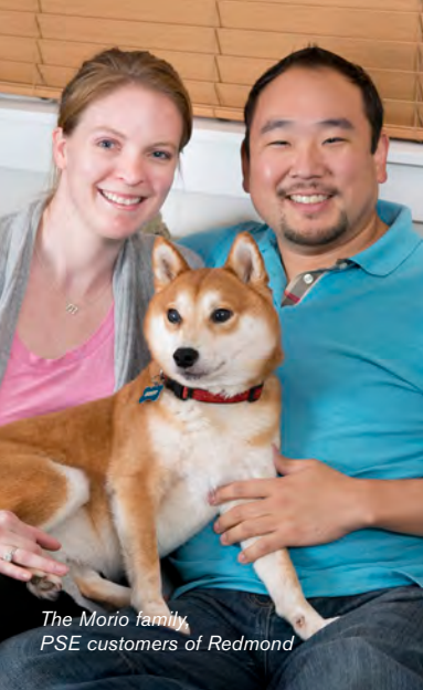
The Morio family PSE customers of Redmond