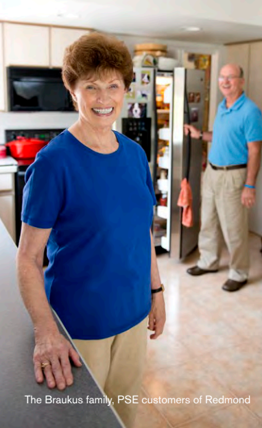
The Braukus family, PSE customers of Redmond