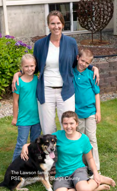
The Lawson family, PSE customers of Skagit County