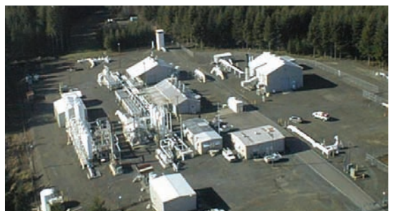
One-fourth of the natural gas Pacific Northwest homes and businesses require on a cold winter day can be drawn from Puget Sound Energy's newly expanded Jackson Prairie gas-storage facility in Lewis County.

Two years ago, the area awoke to the devastation of the Hanukkah Eve Storm of December 2006, leaving 700,000, or 75 percent, of PSE customers and a total of more than 1 million without power in Western Washington. Since then, PSE has worked hard to improve response processes and to