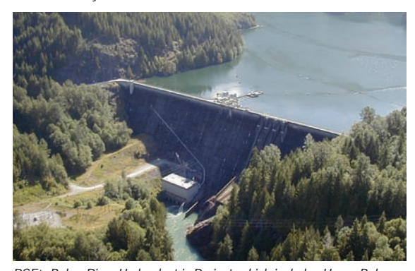
PSE's Baker River Hydroelectric Project, which includes Upper Baker Dam (shown), recently received a new federal operating license that authorizes another 50 years of PSE power generation at the North Cascades facility. Under the new license, PSE will boost salmon runs, enhance wildlife habitat, and provide greater recreational opportunities. The Baker River facility, PSE's largest hydroelectric operation, meets the total power needs of 60,000 households.