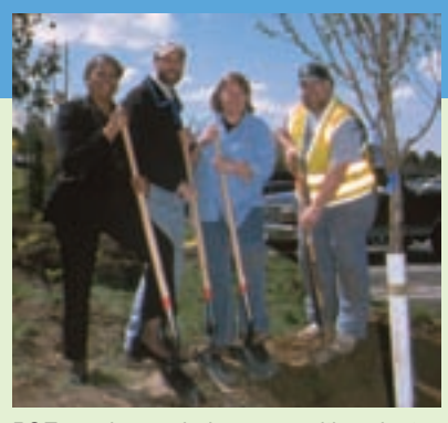
PSE employees help communities plant low-growing trees.

PSE has received the Tree Line USA award from the Arbor Day Foundation for nine years in a row in recognition of the utility's efforts to protect and enhance urban forests while ensuring reliable service.