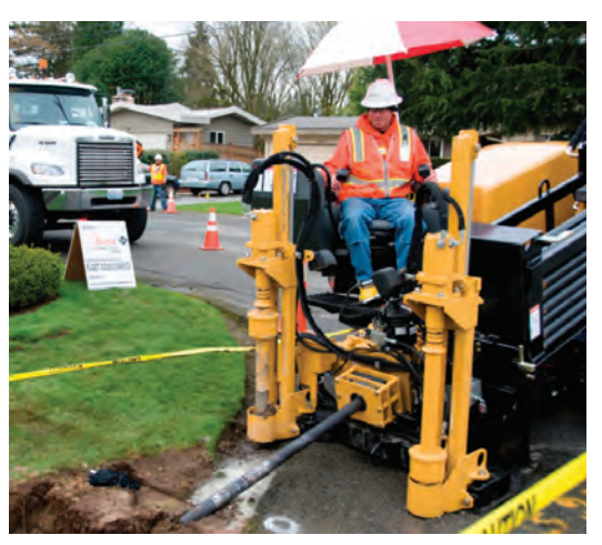
Natural gas main upgrade work in Bellevue

PSE's 24,000 miles of natural gas mains and service lines to residential, commercial and industrial customer meters consist of a mixture of steel and plastic pipe in various ages and conditions. Throughout the year, 150 natural gas technicians