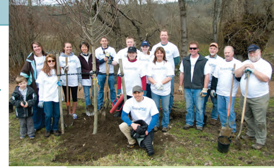
TeamPSE representatives and family members plant trees in Snoqualmie, a Tree City USA community.