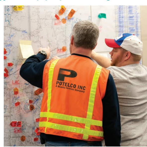
When PSE's updated outage management system comes online later this year, utility employees will use computers, not sticky notes, to track restoration efforts.

Moving away from decades-old systems. PSE has adopted a new outage management system (OMS) that will assist in crew management, improve powerrestoration efforts and provide customers with more accurate information on the status of outages.