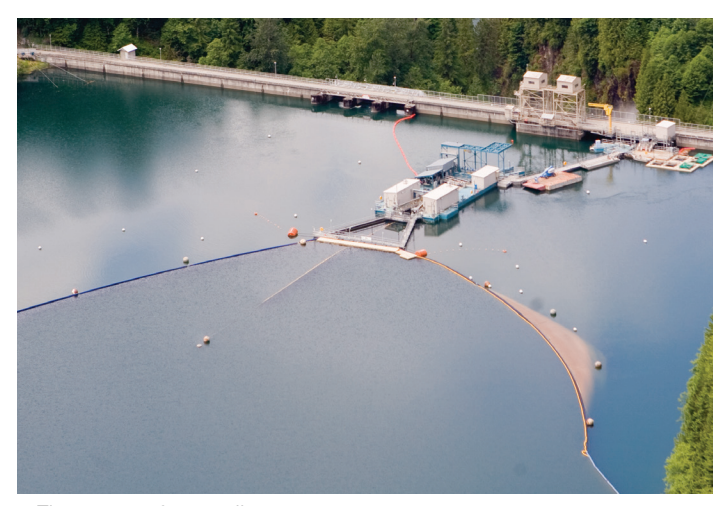
▲ Floating surface collector

Property taxes levied on PSE's Skagit and Whatcom County facilities, including the Baker River Hydroelectric Project, provide significant revenues for local schools, county roads, and other public services.