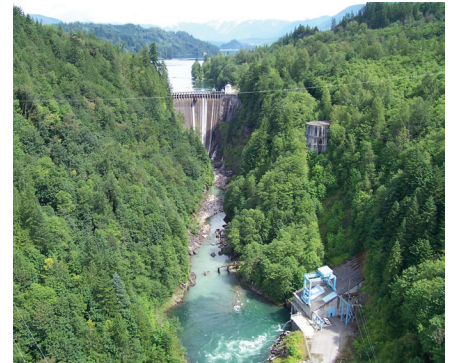
Baker River hydroelectric project

The Baker River is a major tributary of the Skagit River, one of Washington state's most prolific river systems for fish. Over the years, advances in technology, greater knowledge of fish biology, ongoing PSE investments in fisheries systems and continued collaboration with resource agencies and Northwest Indian tribes have produced significant gains in the river's fish stocks. These gains show great promise to continue in the years ahead.