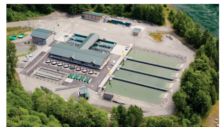
Baker River fish hatchery

In 2010, PSE completed construction of an advanced fish hatchery and refurbished Sockeye spawning beach located near the Upper Baker Dam. The performance of these facilities increased Sockeye fry production two-fold from levels prior to 2008. Each year since completion, more than 5 million Sockeye fry have been produced and released into the Baker Basin reservoirs. By comparison, PSE's previous Baker River fish-culture facility, which slowly expanded from its start in the early 1970s, could produce about 1.7 million fry per year.