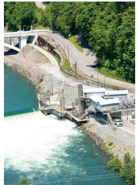
Lower Baker River fish trap

In 2023 65,512 Sockeye were collected at the trap—breaking all previous records. Two years later in 2025 the number of Sockeye returning to the Skagit/Baker River system was nearly 93,000.