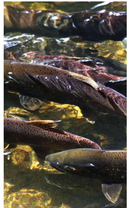
Sockeye, Chinook and Coho salmon

The project's license calls for major PSE initiatives to further enhance fish populations in the Skagit-Baker watershed, including installation of new upstream and downstream fish-passage facilities, construction of a new fish hatchery, construction of a second Lower Baker powerhouse for better river-flow control, and riparian-habitat protection. Fisheries managers expect PSE's Baker River investments to produce continued increases in the river's salmon runs and expanded recreational, tribal and commercial fishing opportunities.