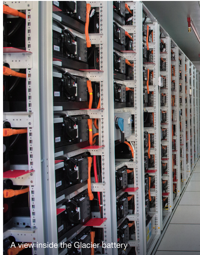
A view inside the Glacier battery