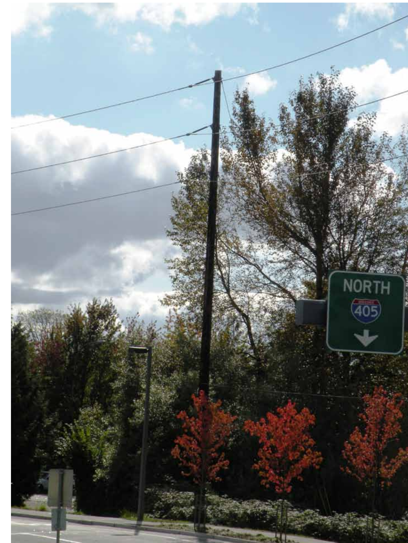
Single-circuit 115 kV wood pole without distribution underbuild