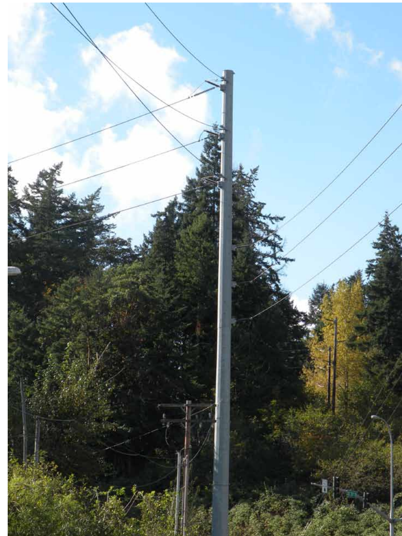
Single-circuit galvanized steel monopole (self-supporting)