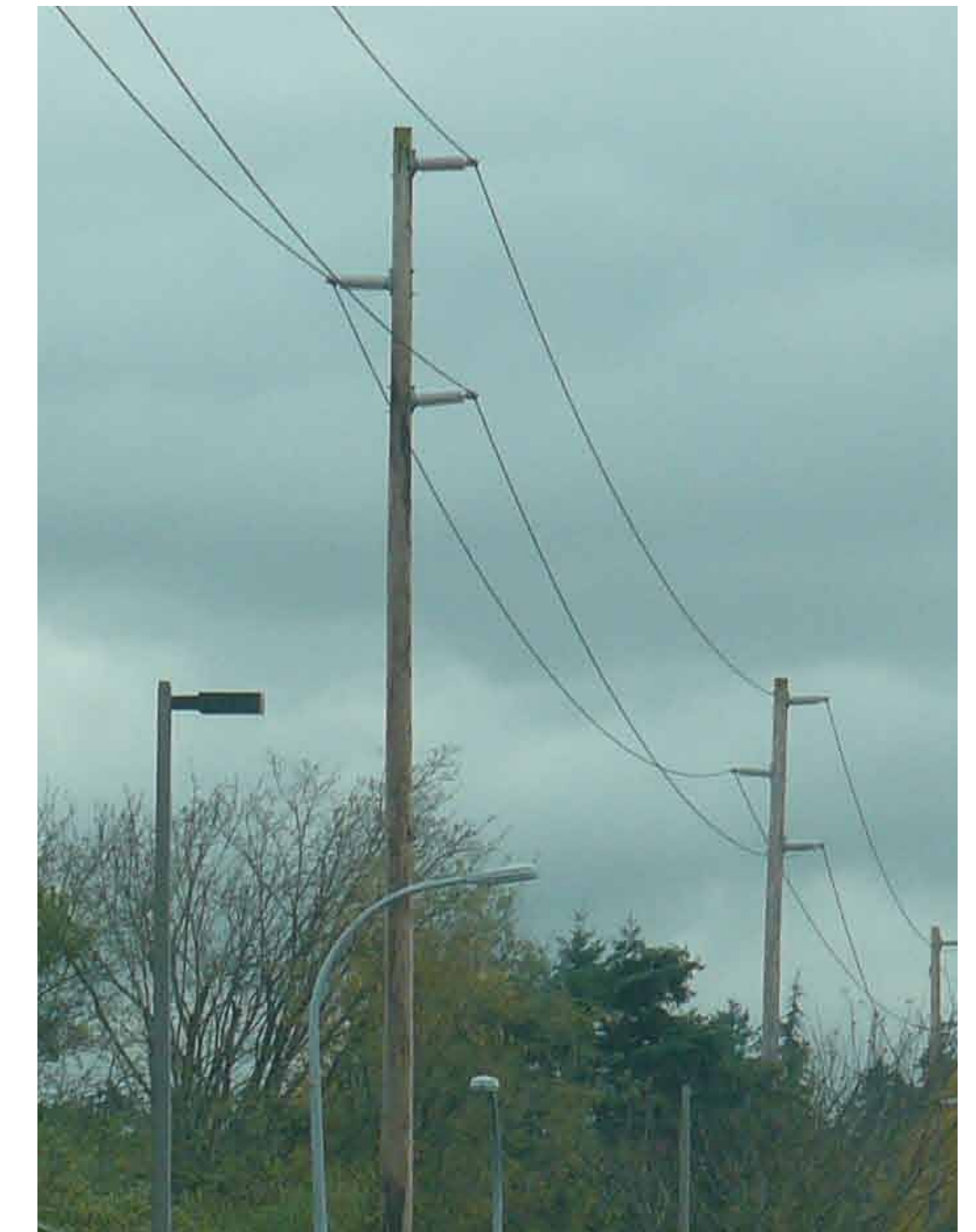
Single-circuit 115kV pole without distribution underbuild