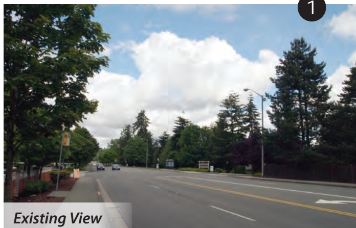
Totem Lake Rail Corridor Looking East