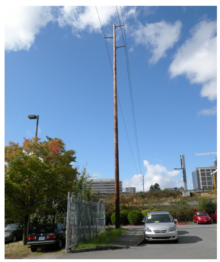
Example 115 kV pole design

PSE anticipates using some combination of wood or steel poles. Steel lattice towers will not be used for this project. The photo to the right shows an example 115 kV pole design. To view other examples poles, visit pse.com/sammjuan115.