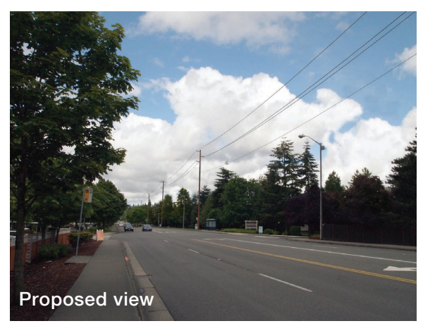
View other photo simulations at pse.com/SammJuan115