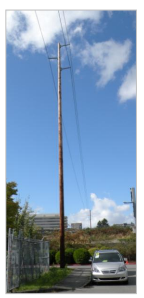
Figure 2. Example 115 kV pole design

PSE anticipates using some combination of wood or steel poles. Steel lattice towers will not be used for this project. Figure 2 shows an example 115 kV pole design. To view other examples poles, visit PSE.com/SammJuan115.