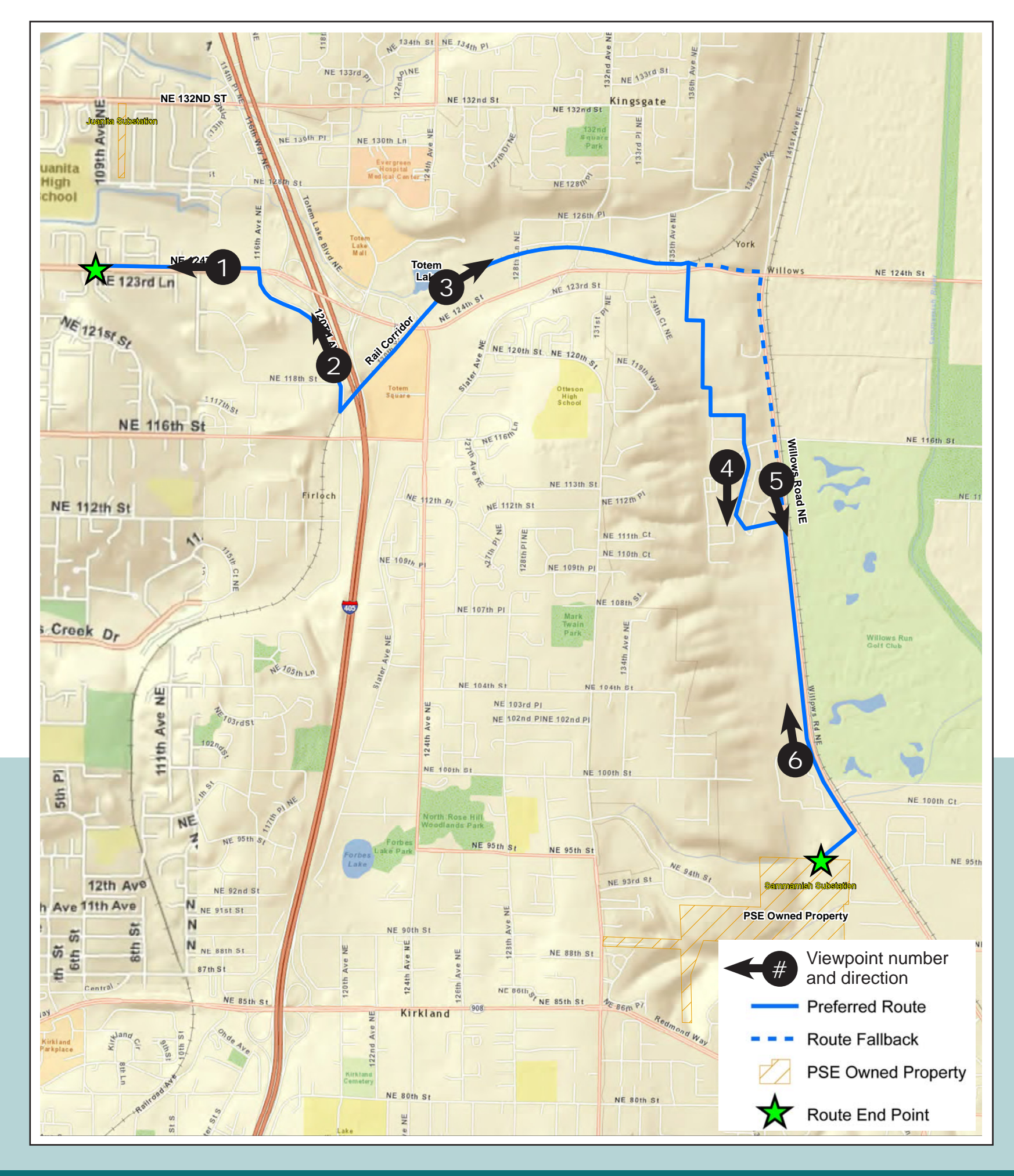
Photo simulations are conceptual and for discussion purposes only. The pole locations, pole types, wire configurations and tree clearing requirements will be determined during final design.