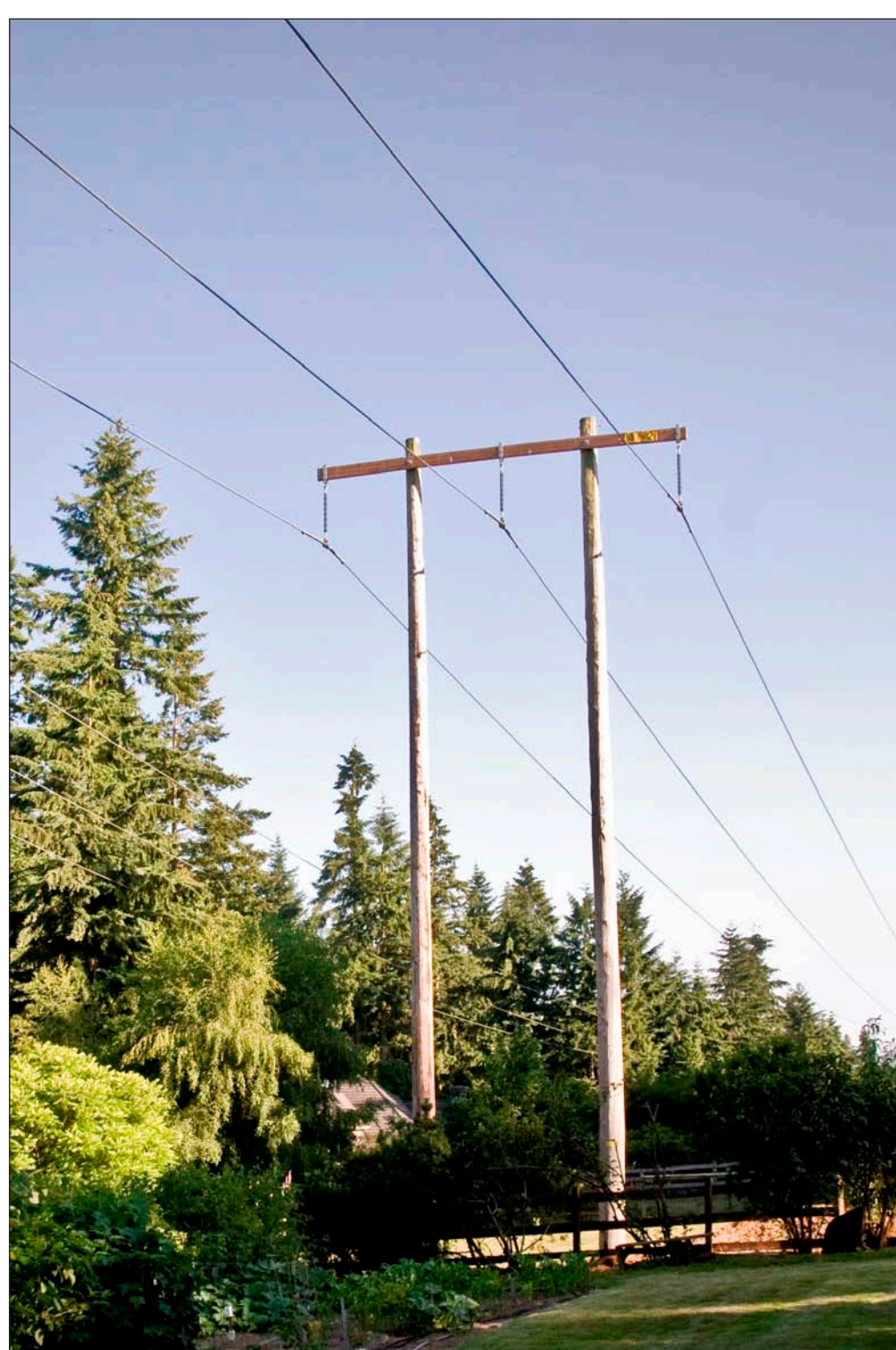
Single-circuit 115 kV wood H-frame structure