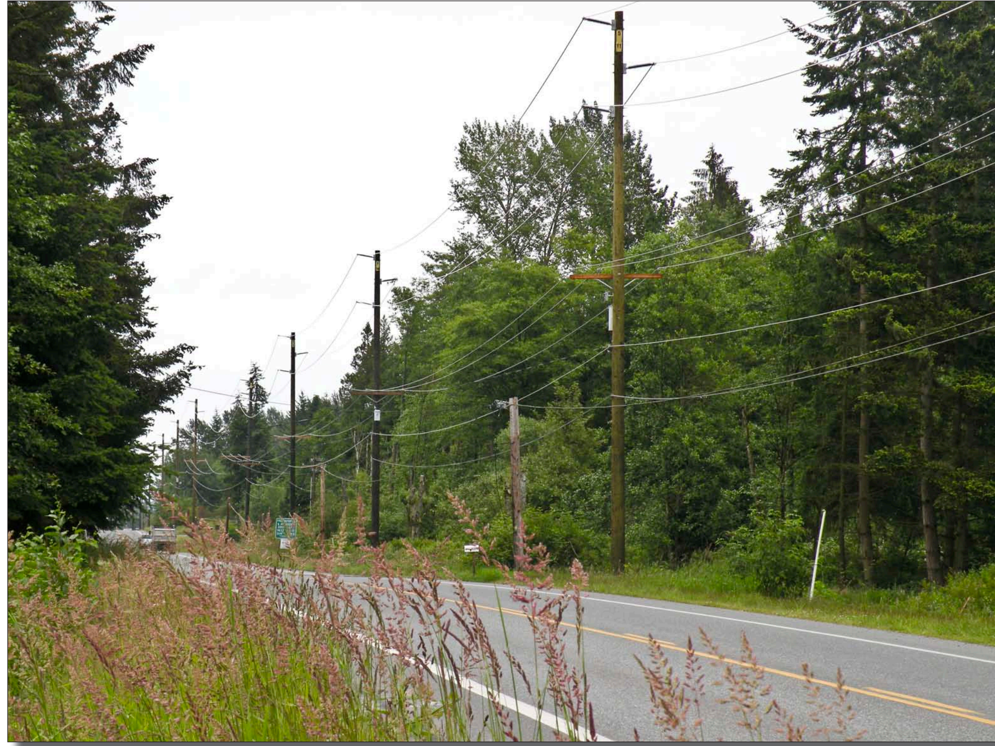
Single-circuit 115 kV wood pole with distribution underbuild