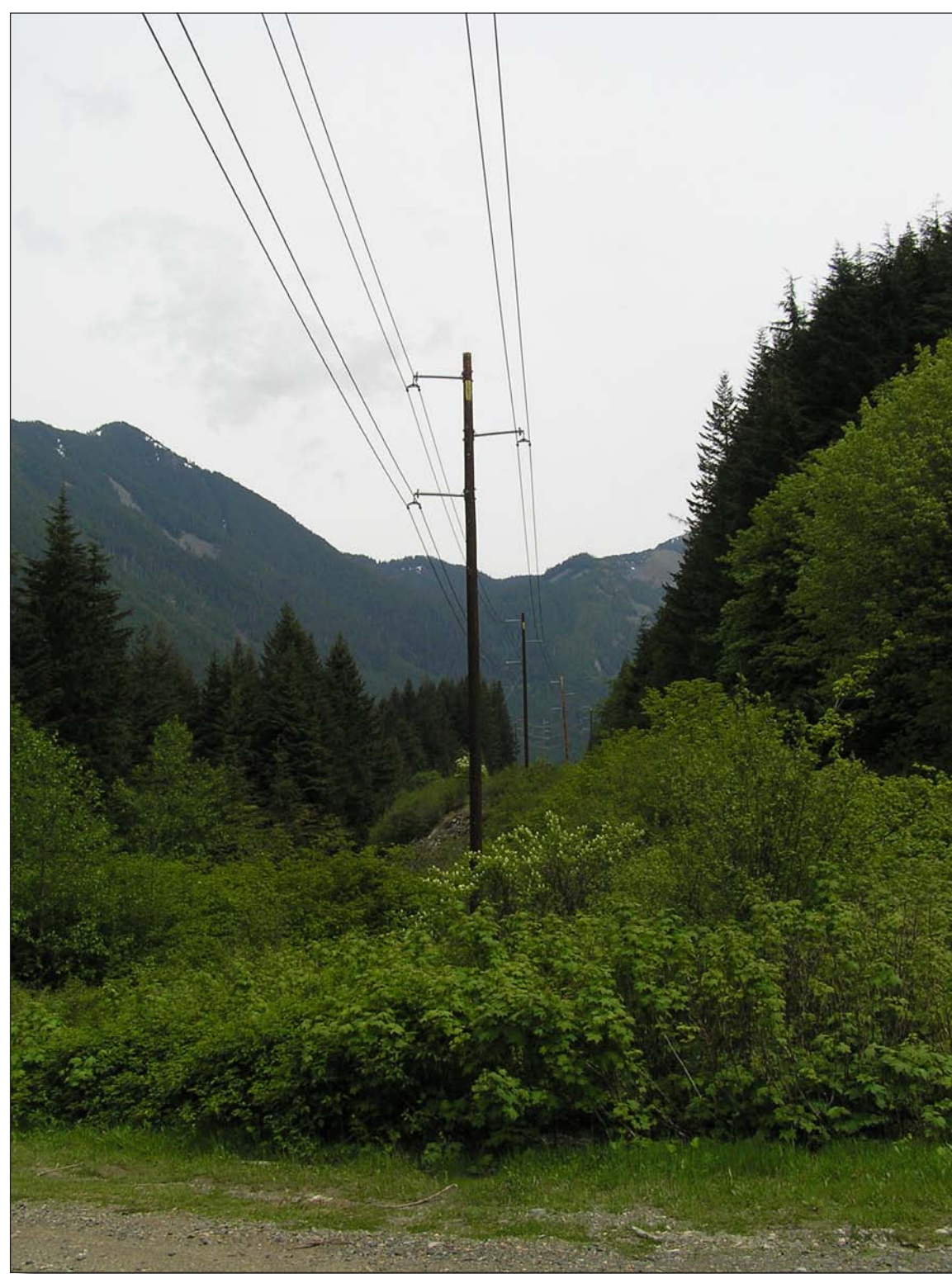
Single-circuit 115 kV wood pole with bundled conductor