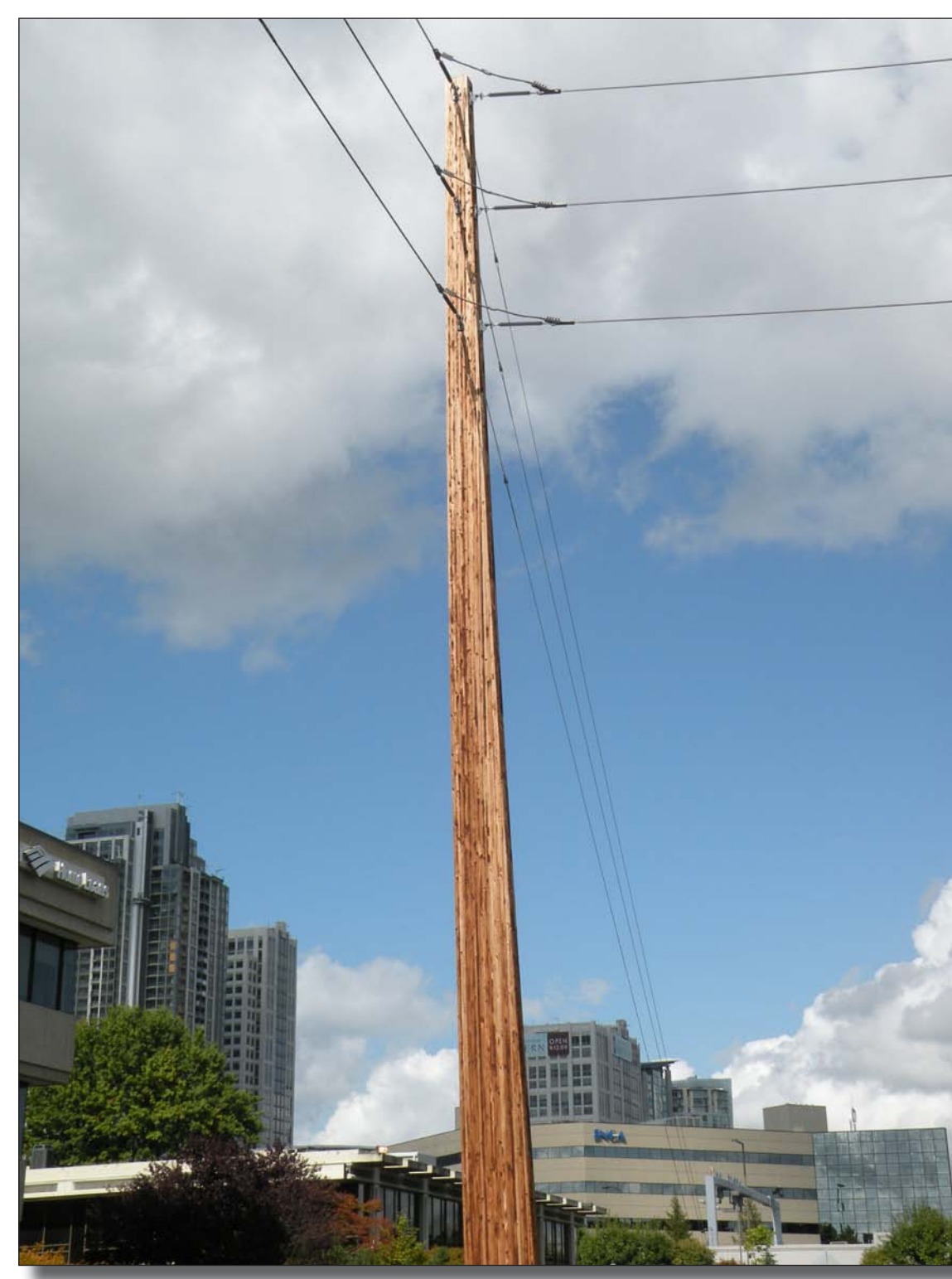
Single-circuit glu lam pole