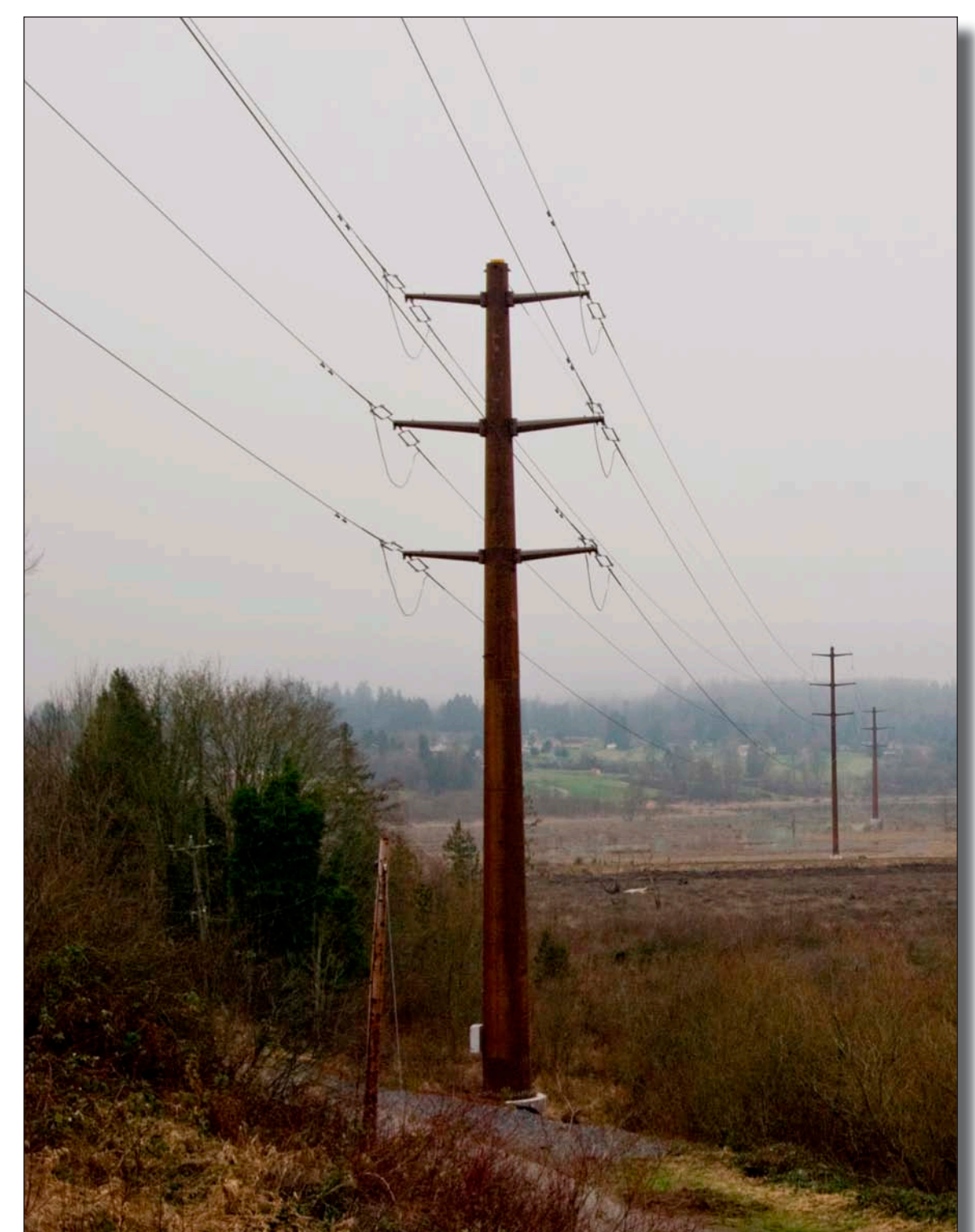
Double-circuit weathered steel monopole