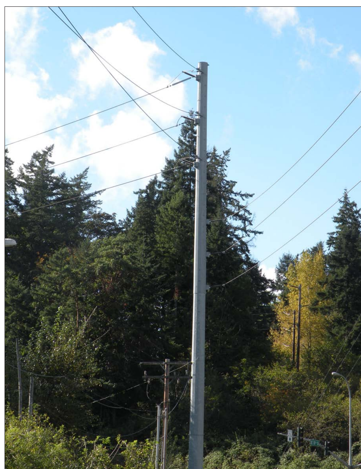
Single-circuit galvanized steel monopole